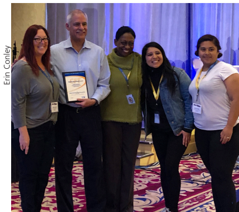
Leaders from Ventura County Federation of Paraeducators, Local 4434A accept their award for membership growth. The local increased its membership by 23% through worksite visits at several locations across Ventura county.