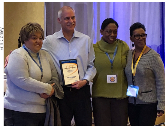
Leaders from the Antelope Valley College Federation of Classified Employees, Local 4683 increased their membership by 26% through an extensive organizing drive. They also recommitted nearly 80% of their local on new membership forms.

trained approximately 25 locals on Hustle, a peer-to-peer texting platform that allows quick and easy texting to multiple people. Locals have used Hustle successfully to engage and activate in so many ways, including texting out links to their e-membership forms and signing up non-members; turning out for meetings, actions and events; election cycle volunteer recruitment and outreach; sending out links to contract surveys;