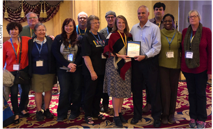
Members of UC-AFT accept their organizing award. The locals increased their membership through one-on-one classroom visits, events and actions resulting in 647 new members.

or smart phone. To date, almost 2000 e-membership forms have been submitted for 45 locals. ABC Federation of Teachers, Local 2317 gets a big shout out for using their e-membership form to re-commit almost 700 of their existing members and their site reps got the rest of their members re-committed on paper applications. We have also created accounts for and