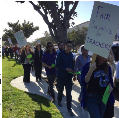
Members picket outside the school board chanting and marching in strong unity!

-By SVFT Building Representative Kati Bassler