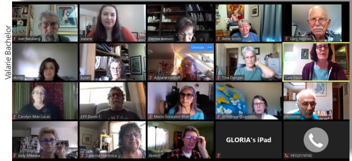
Santa Rosa Junior College Federation of Teachers, Local 1946 May general membership meeting and EDD workshop via Zoom.