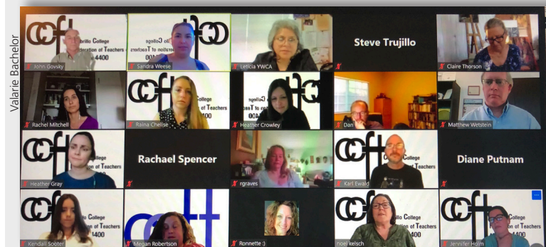
CCFT members mobilize to the June board of trustees ZOOM meeting.

Leaders at Cabrillo College Federation of Teachers, Local 4400 (CCFT) organized a phone bank in early April to reach out to bargaining unit members about COVID-19 and the impact it would have on spring 2020 courses. As everyone hurried to transition their classes online, members of the executive board, site rep. council and member volunteers took to the phones to check in on over 400 colleagues and share the important work the union was doing to protect their rights during the global pandemic. Through the phone bank and by using Hustle, they were able to mobilize over 100 faculty to