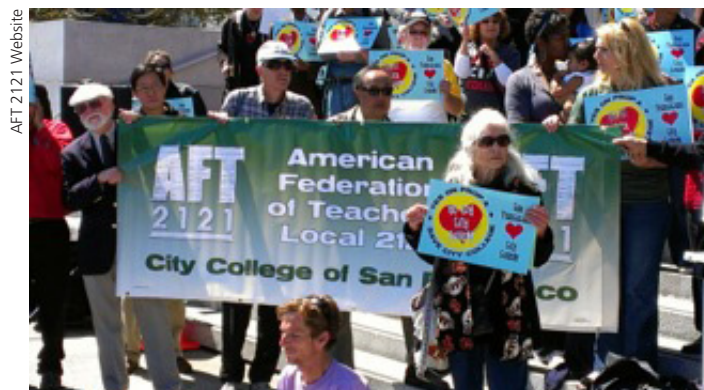
AFT 2121 Website

standards, including measuring student learning, school governance, and managing finances. This sanction requires the college to demonstrate why it shouldn’t lose its accreditation after this academic year.