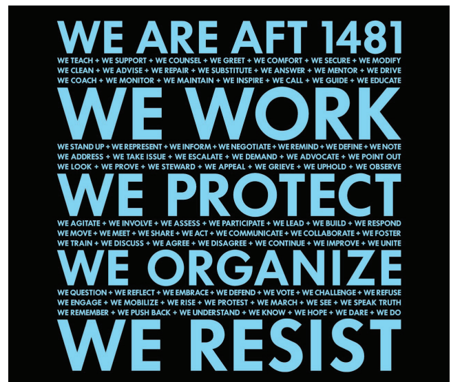
JFT's t-shirt artwork, which captures the local's message of classified and certificated union solidarity.

place and improved benefits. Over 30 members attended the action, sending