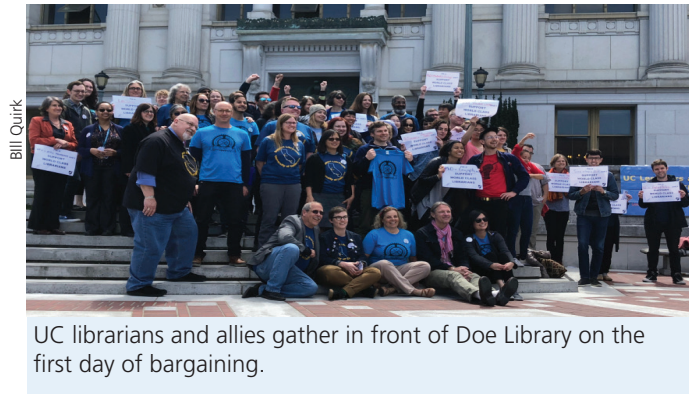
UC librarians and allies gather in front of Doe Library on the first day of bargaining.

On April 17, the University of California librarians opened this round of contract negotiations with their first bargaining session at Doe Library on the UC Berkeley campus. Wearing t-shirts and buttons made specially for the occasion that read “Librarians Will Not Be Silent,” the representatives of UC-AFT filed into the room followed by other UC librarians and lecturers who had come from all over the state to give support to the table team and demonstrate union strength to the negotiators on the opposite side of the table. The first agenda item was introductions, and the librarians took this opportunity to explain the academic and educational value of their work. One by one, the members of the negotiating team described the world-renowned collections they curate and maintain, the scholars who come from far and wide to use these resources, the students who rely on the guidance of librarians as they learn to conduct specialized research, the professional development