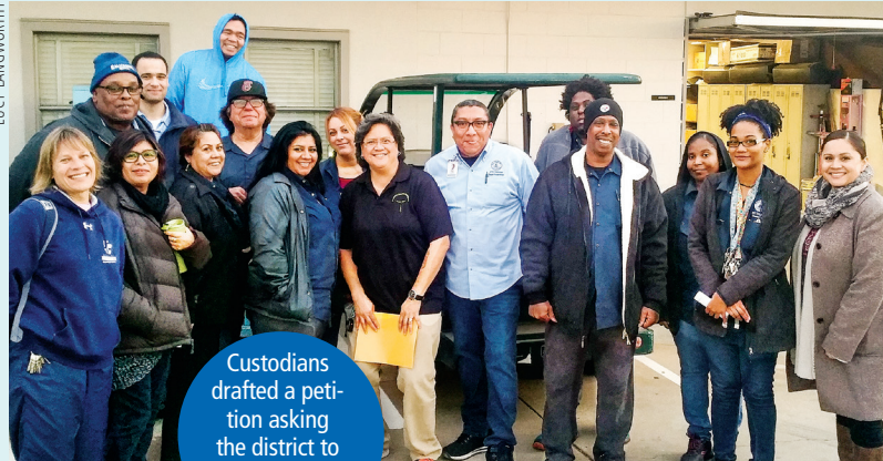
Custodians drafted a petition asking the district to collaborate on workloads.

assigned to hotel staff. There are nearly 50 runs on campus, almost double the number of custodians. When vacations and sick coworkers are taken into account, staff are almost always forced to work two or