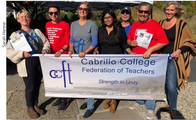
CFT organizers along with CCFT members and staff spent a week talking to Cabrillo College faculty about re-committing to their union and becoming COPE contributors.

In October, leaders from the Cabrillo College Federation of Teachers, Local 4400 (CCFT) worked with CFT to organize a membership outreach drive to educate members about gains made during bargaining. They asked all members to recommit to the union by signing new membership forms and asked non-members to sign up. In order to prepare for the board of trustees' races in 2020, members were also asked to contribute to COPE. With support from the northern California organizing team, leaders talked to 10% of the bargaining unit over the course of three days. Out