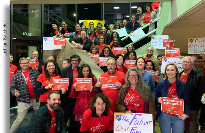
SMCC faculty amass at their district office for trustees' meeting.

The action was energetic, positive and the board room was packed with many faculty that board members had to enter through a back door rather than weave their way through the crowd.