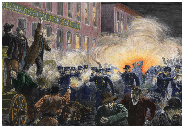
Artist's conception of Haymarket events, 1886.

While it would not be until 1938, with passage of the Fair Labor Standards Act, that workers in the United States were finally granted an eight-hour day, other countries soon began celebrating May 1 in memory of the Haymarket Square martyrs. Beginning in 1889, May 1 was identified as International Workers' Day, and since that time over 100 countries recog-