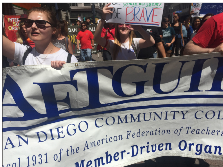
The largest contingent in the San Diego march came from AFT Local 1931.