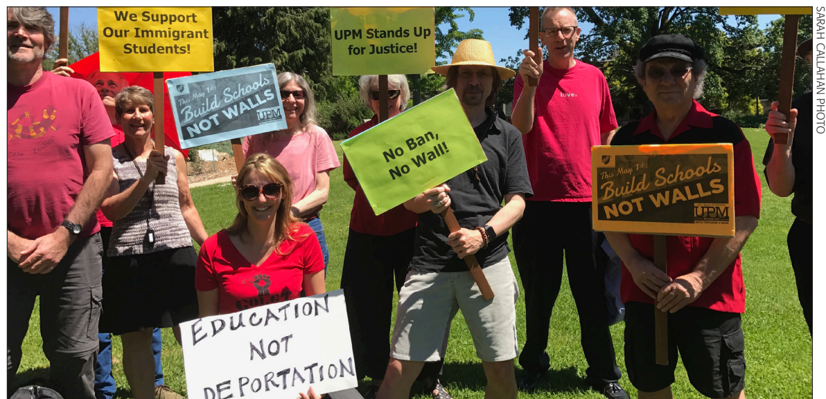
United Professors of Marin, AFT Local 1610, rallied at their Mill Valley campus.