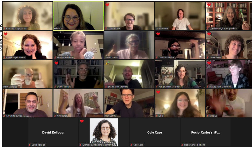
Faculty on the Organizing Committee of the ArtCenter College Faculty Federation celebrate as they file for union recognition with the NLRB.

Part-time and full-time faculty at ArtCenter College of Design in Pasadena filed a petition with the National Labor Relations Board (NLRB) on April 7 for union recognition with CFT. The group of almost 600 art and design educators provide instruction to 1800 students from around the world. ArtCenter is renowned for its relationships with companies in the entertainment and automotive industries, and faculty are lauded for training highly skilled designers who go on to great success in