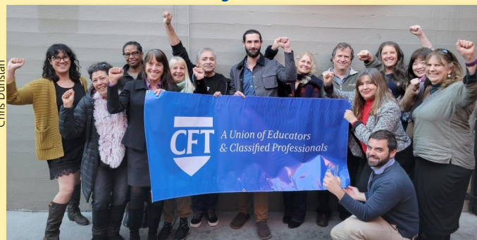
Full-time faculty members of Dominican University of California celebrate their election results on April 13.

Following a successful petition where over 70% of full-time faculty signed authorization cards to form a union with CFT, faculty at Dominican University of California had another outstanding win in their union election. On April 11, excited faculty watched as the National Labor Relations Board conducted a ballot count resulting in a resounding 84% yes vote for union representation. Three key organizers of the efforts have shared their thoughts about the win.