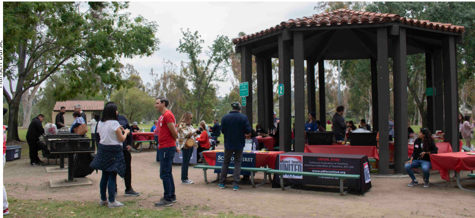
AdFac Members gather in-person for the first time in over two years to celebrate their union's accomplishments.

strategy. We also reached out to our union allies in the district, and Schools-First Federal Credit Union about presenting their financial resources for our members. We wanted our event to be both practical and enjoyable.