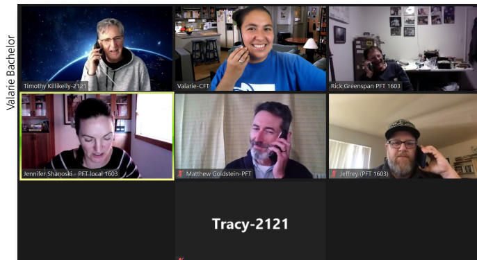
PFT faculty phone banking AFT 2121 members to update them on impact bargaining.