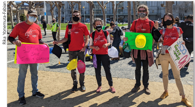
SMCC faculty show their support by attending and speaking at city college rallies.

What did you do to support AFT 2121? I recruited members of our local's organizing committee to join me in attending ral-