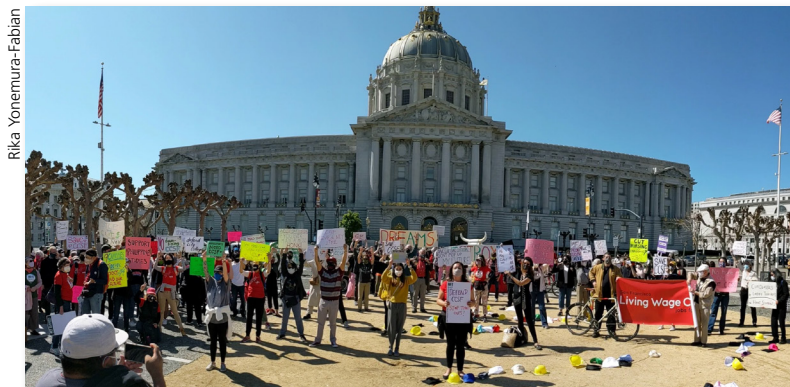
AFT 2121 faculty, students and allies turn out to San Francisco City Hall to call on electeds to fund City College!