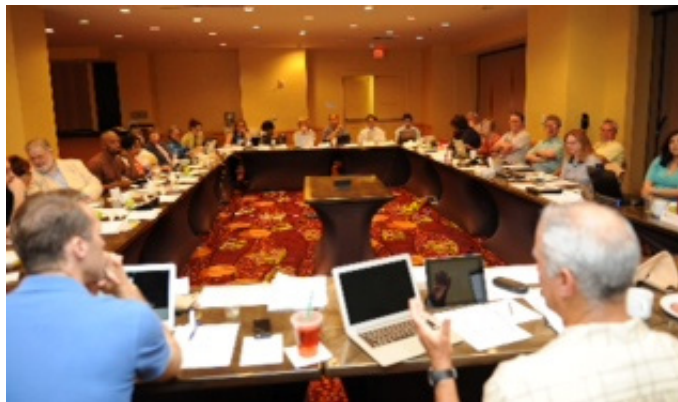
CFT Executive Council members discuss and make final determinations on SCIO grant recipients.

At this year's convention, the CFT passed a resolution committing itself to working with community partners on a Quality Public Education Campaign