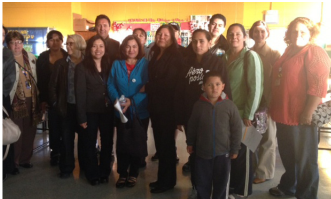
Parents, students, and educators participate in one of Jefferson Elementary Federation of Teachers, Local 3267's Parent Education Nights.

Indeed, looking ahead, the Jefferson Elementary School District expects stable funding for the next seven years. Today, the district has over $18 million in reserves. Teacher salary increases would cost approximately $1 million, or about 7% of the total reserve. Regardless