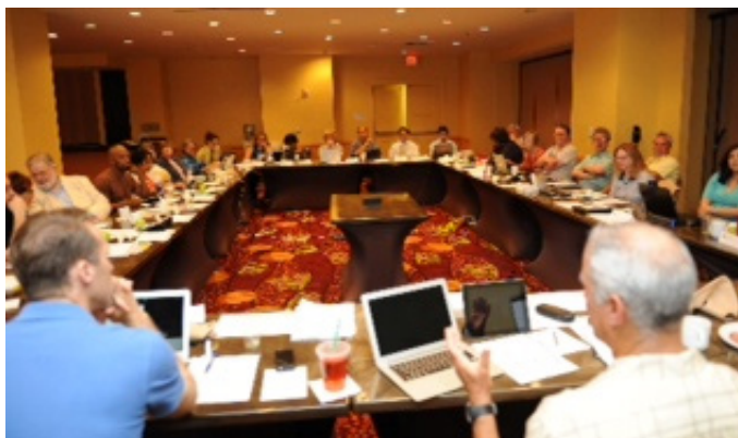
CFT Executive Council members discuss and make final determinations on SCIO grant recipients.

At this year's convention, the CFT passed a resolution committing itself to working with community partners on a Quality Public Education Campaign