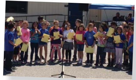
Jackson Academy of Math and Music third graders sing at the festival.

Solutions and Discovery Counseling providing information on their services for students and families, and Morgan Hill Library signing people up for library cards and discussing their current literacy projects. Foothill Community Health Center provided information on their free clinics and performed dental health screenings. The Learning and Loving Center was present as well, discussing the services they have available for non-English speaking community members. Kaiser Permanente and Second Harvest Food Bank distributed materials to support healthy students and families in our community, and the Morgan Hill Unified School District booth invited attendees to register for The Superintendent's Health Challenge – Easy as 1-2-3.