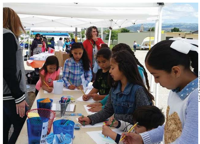
Creating cards at the Teacher Appreciation Day activity booth.