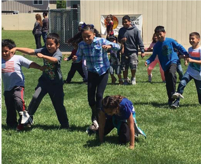
Students participate in a three-legged race at the Friends and Family Festival.

On Saturday, April 23, the Morgan Hill Federation of Teachers (MHFT) held their 1st Annual MHFT Friends and Family Festival. This four-hour event was held at P.A. Walsh STEAM Academy in Morgan Hill, and was organized in order to celebrate public education and neighborhood schools. Teachers, students and their families came out for a day full of entertainment, activities and information for the entire family.