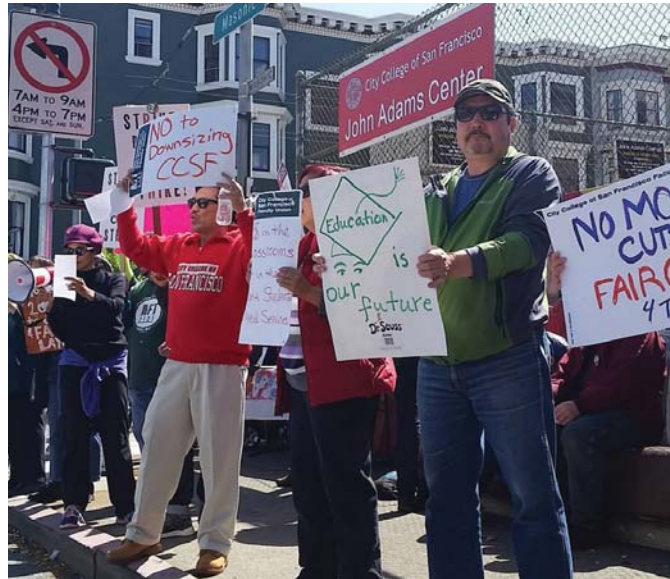
AFT local 2121 members and community supporters picket outside John Adams Campus in the Lower Haight, San Francisco.

Since the accreditation crisis our union has been shifting from a “service model” of unionism to an organizing model, focused on building power through