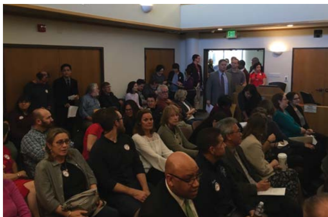
Packed house at the BOT meeting at the College of San Mateo. Standing-room only with over 60 faculty in attendance to win workload equity for members of San Mateo Community College Federation of Teachers, AFT Local 1493.