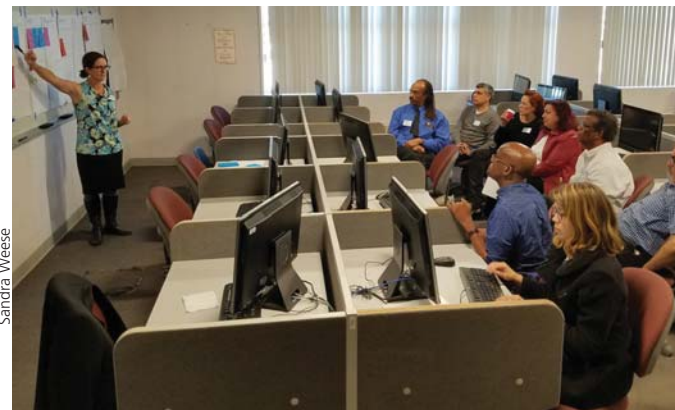
Compton College faculty work with CFT staff to make a strategic plan to build a stronger union by increasing membership and engaging members on critical issues.

- By Suleman Ishaque and Tema Staig, SCI Organizers, Locals 1521A and 1521