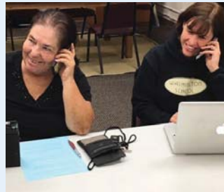
Berkeley Federation of Teachers members phone bank for Prop 55 and Measure E1, which helps fund Berkeley schools.