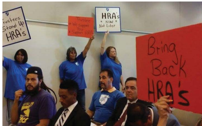
Members from sister locals 1521 & 1521A rally to keep their HRA.