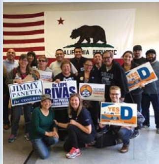
Pajaro Valley Federation of Teachers members canvass for Prop 55 and local candidates at the Watsonville Democratic office.