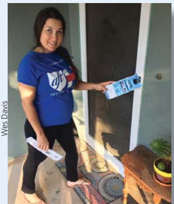
Newport-Mesa Federation of Teachers members launched many canvasses out of the local office to walk for Prop 55 and local candidates.