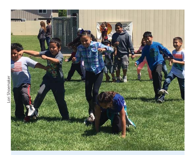
Students particiapte in a three-legged race at the Friends and Family Festival.

On Saturday, April 23, the Morgan Hill Federation of Teachers (MHFT) held their 1st Annual MHFT Friends and Family Festival. This fourhour event was held at P.A. Walsh STEAM Academy in Morgan Hill, and was organized in order to celebrate public education and neighborhood schools. Teachers, students and their families came out for a day full of entertainment, activities and information for the entire family.