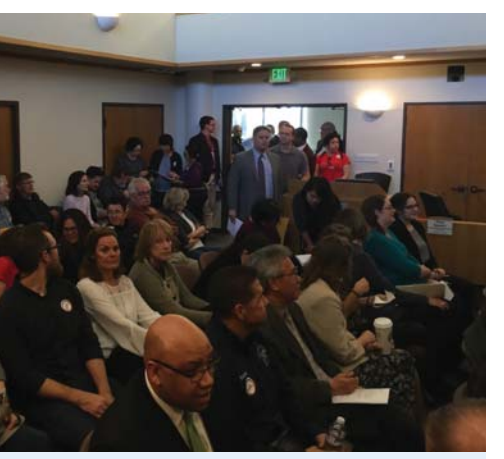
Packed house at the BOT meeting at the College of San Mateo. Standing-room only with over 60 faculty in attendance to win workload equity for members of San Mateo Community College Federation of Teachers, AFT Local 1493.