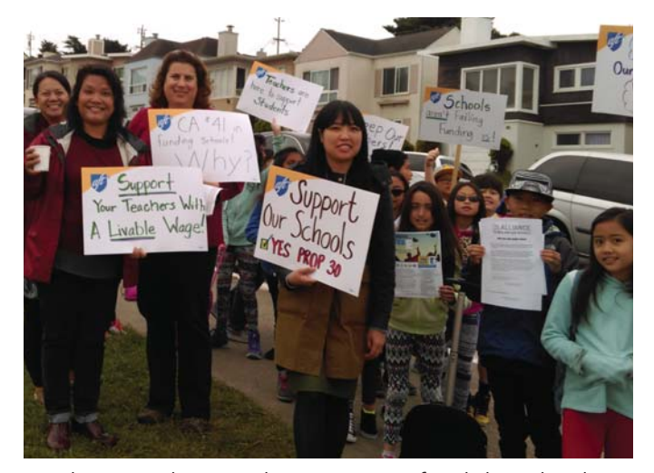
Teachers, students and parents say "fund the schools our children deserve" in Daly City as part of the national AROS walk-ins on May 4. #ReclaimOurSchools