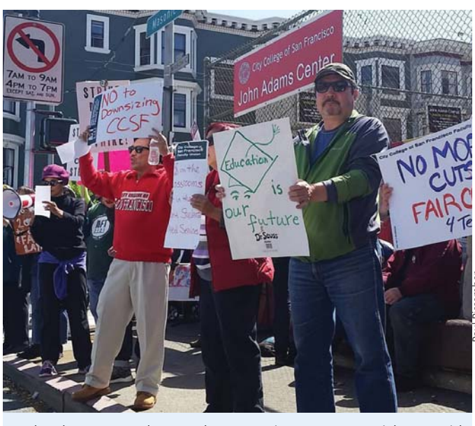
AFT local 2121 members and community supporters picket outside John Adams Campus in the Lower Haight, San Francisco.

Since the accreditation crisis our union has been shifting from a "service model" of unionism to an organizing model, focused on building power through