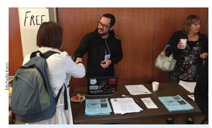
Local member volunteers give out free books and resources to conference attendees.

The Schools Our Children Deserve conference was held at Skyline College on Saturday, March 19, and featured speakers and panelists from all over San Mateo County, the greater Bay Area and from the national union based in Washington DC. The conference planners were assisted by staff from the