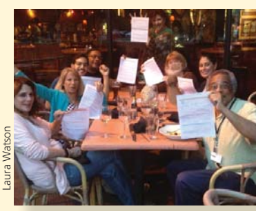
ACE leaders showing off new member forms they collected during their drive.

We just wrapped up a successful membership drive, adding 60 new members to ACE Local 6554! Even more impressive is that 37 volunteers engaged in 103 face-to-face conversations about meaningful issues that affect part-time faculty, such as how to obtain Reemployment Preference (REP) and how to apply for Unemployment Insurance.