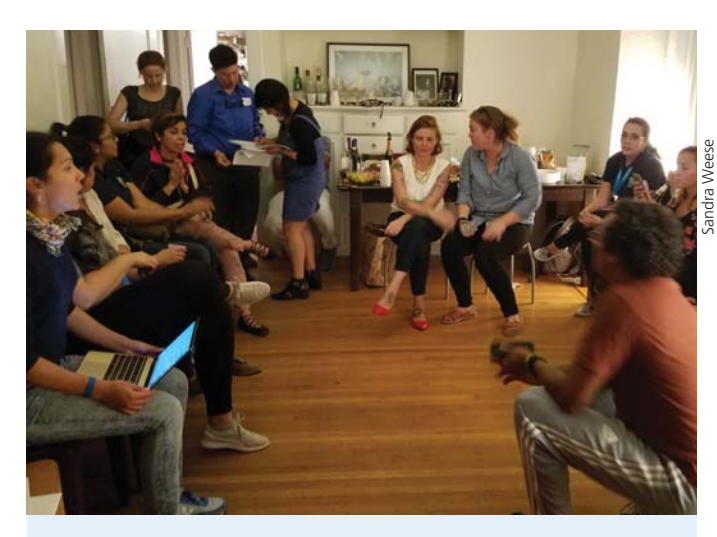
EBI teachers and staff meet and make a plan to "Get out the Vote" for the NLRB election to join the CFT.

On October 18, 2016, an overwhelming majority of ballots cast voted in favor of being represented for the purpose of collective bargaining. Like our French counterparts, many of our faculty and staff come from abroad, representing various Spanish-speaking countries. These countries include Mexico, El Salvador, Spain, Argentina, Cuba, Peru, Chile and many more. Our