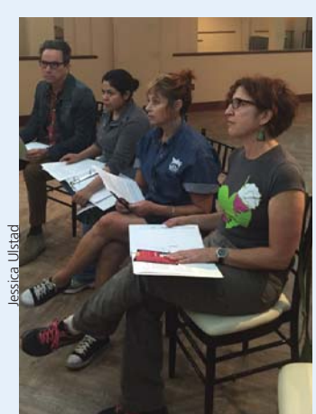
UTLA members prepare for a canvass for Prop 55 and endorsed local candidates.