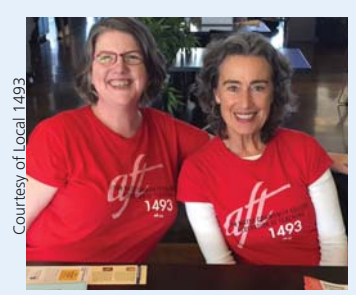
San Mateo Community College Federation of Teachers table for Prop 55 on campus.