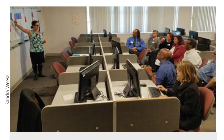
Compton College faculty work with CFT staff to make a strategic plan to build a stronger union by increasing membership and engaging members on critical issues.