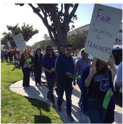
Members picket outside the school board chanting and marching in strong unity!

-By SVFT Building Representative Kati Basssler