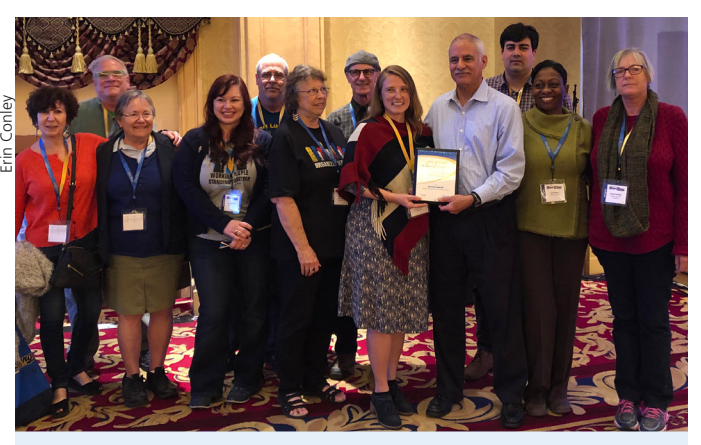
Members of UC-AFT accept their organizing award. The locals increased their membership through one-on-one classroom visits, events and actions resulting in 647 new members.

or smart phone. To date, almost 2000 e-membership forms have been submitted for 45 locals. ABC Federation of Teachers, Local 2317 gets a big shout out for using their e-membership form to re-commit almost 700 of their existing members and their site reps got the rest of their members re-committed on paper applications. We have also created accounts for and