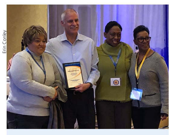
Leaders from the Antelope Valley College Federation of Classified Employees, Local 4683 increased their membership by 26% through an extensive organizing drive. They also recommitted nearly 80% of their local on new membership forms.

trained approximately 25 locals on Hustle, a peerto-peer texting platform that allows quick and easy texting to multiple people. Locals have used Hustle successfully to engage and activate in so many ways, including texting out links to their e-membership forms and signing up non-members; turning out for meetings, actions and events; election cycle volunteer recruitment and outreach; sending out links to contract surveys;