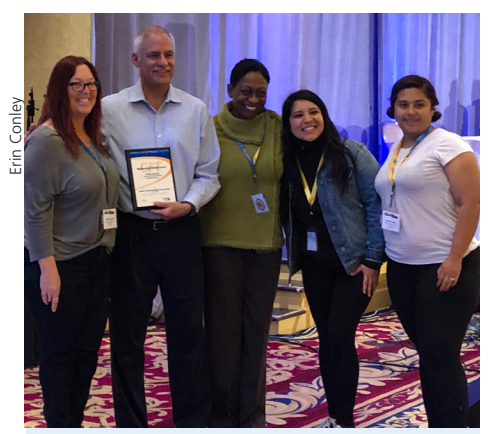
Leaders from Ventura County Federation of Paraeducators, Local 4434A accept their award for membership growth. The local increased its membership by 23% through worksite visits at several locations across Ventura county.